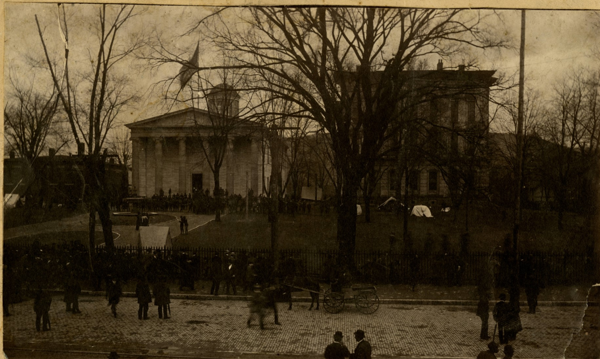
Court House at Frankfort, Ky., where Goebel was killed.