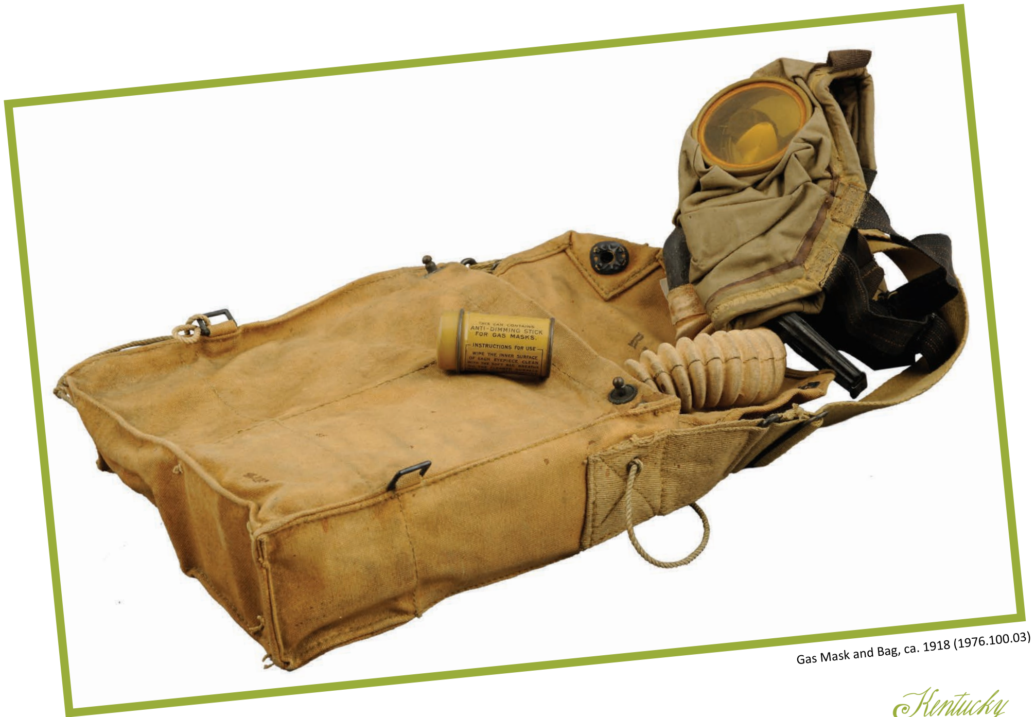
Gas Mask and Bag, ca. 1918 (1976.100.03)