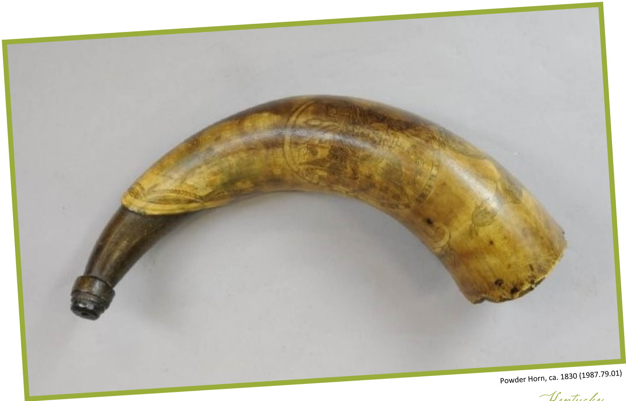
Powder Horn, ca. 1830 (1987.79.01)