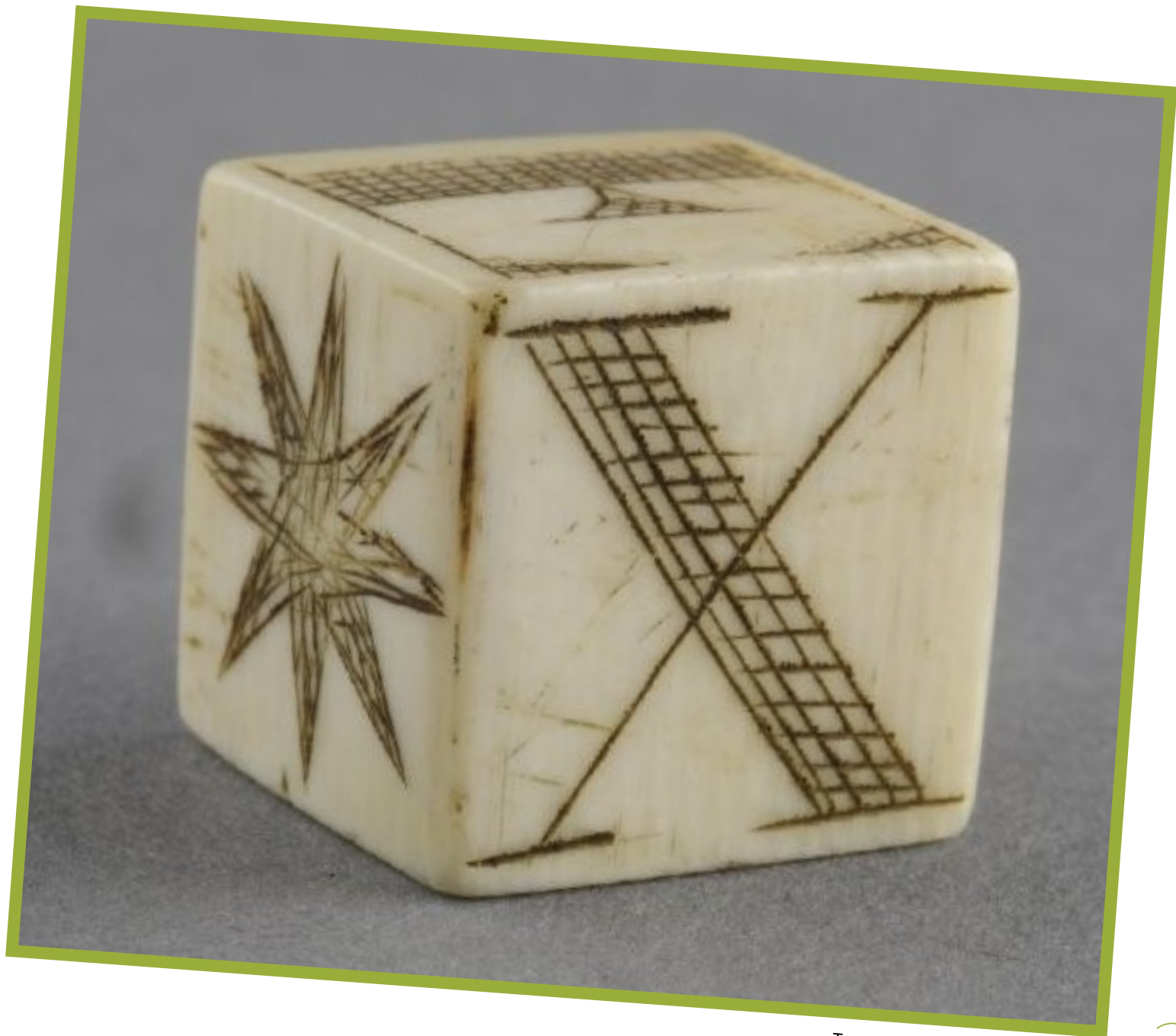
Texas Die, ca. 1843 (1983.02.02)