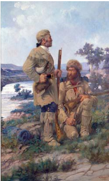
Lewis at Black Eagle Falls, Edgar S. Paxson, oil, 1912

The journey across the continent began in Washington, D.C., but the Corps was assembled in Kentucky and departed for the West from Louisville. Many members of the expedition were recruited in Kentucky, but information about them is limited. Many do not appear in public records, leaving unanswered questions about the identities of these men who ventured west into history. When Lewis and Clark returned to St. Louis, the news was quickly carried to Kentucky, where it was first published in a Frankfort newspaper. That newspaper report was then carried to the East, where the rest of the nation and the world were informed of the return of Lewis and Clark. As the party traveled to Washington, D.C., it crossed Kentucky, enjoying congratulations and celebrations offered in its honor. Number of pieces: